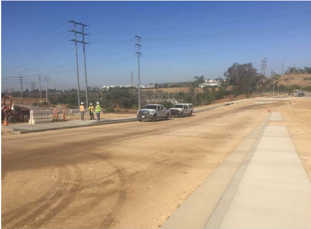
Photograph 2: Standing on the Driveway Forward of the K-rail Looking Southwest into the Substation Site