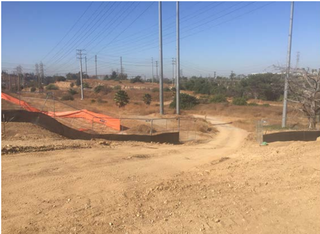
Photograph 3: On Greenwood Avenue at the Driveway Looking Southeast